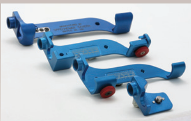
Four of Our Grips

Since 1993, Oppenheimer Camera Products has been producing the Oppenheimer Panhandle System. The first Oppenheimer Panhandle was developed to solve the problem of how to successfully mount a Preston Microforce onto the panhandle of a fluid head. Since we began this project, Oppenheimer Camera Products has introduced many other innovative products for film and video production including specialty lenses, the Spin Axis, on board battery systems, and monitor yoke mounts.